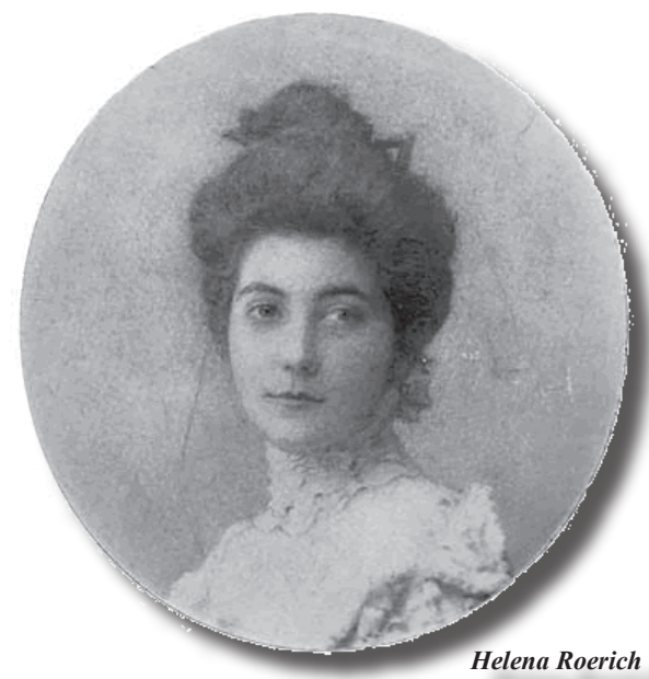
(from the Roerich Museum archives)

Helena Roerich's spiritual name is "Urusvati," which means "a star." In a book of writings by Helena Roerich, titled At the Threshold of the New World, it says: Urusvati is "the symbol of the Mother of the World." In this book it also says, "The Great Era is beginning because the spirit understanding is linked with the Mother of the World.... The approach of this very great Era is important; it will substantially change life on Earth" a prophecy that is read-