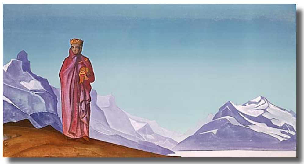
She Who Holds the World by Nicholas Roerich